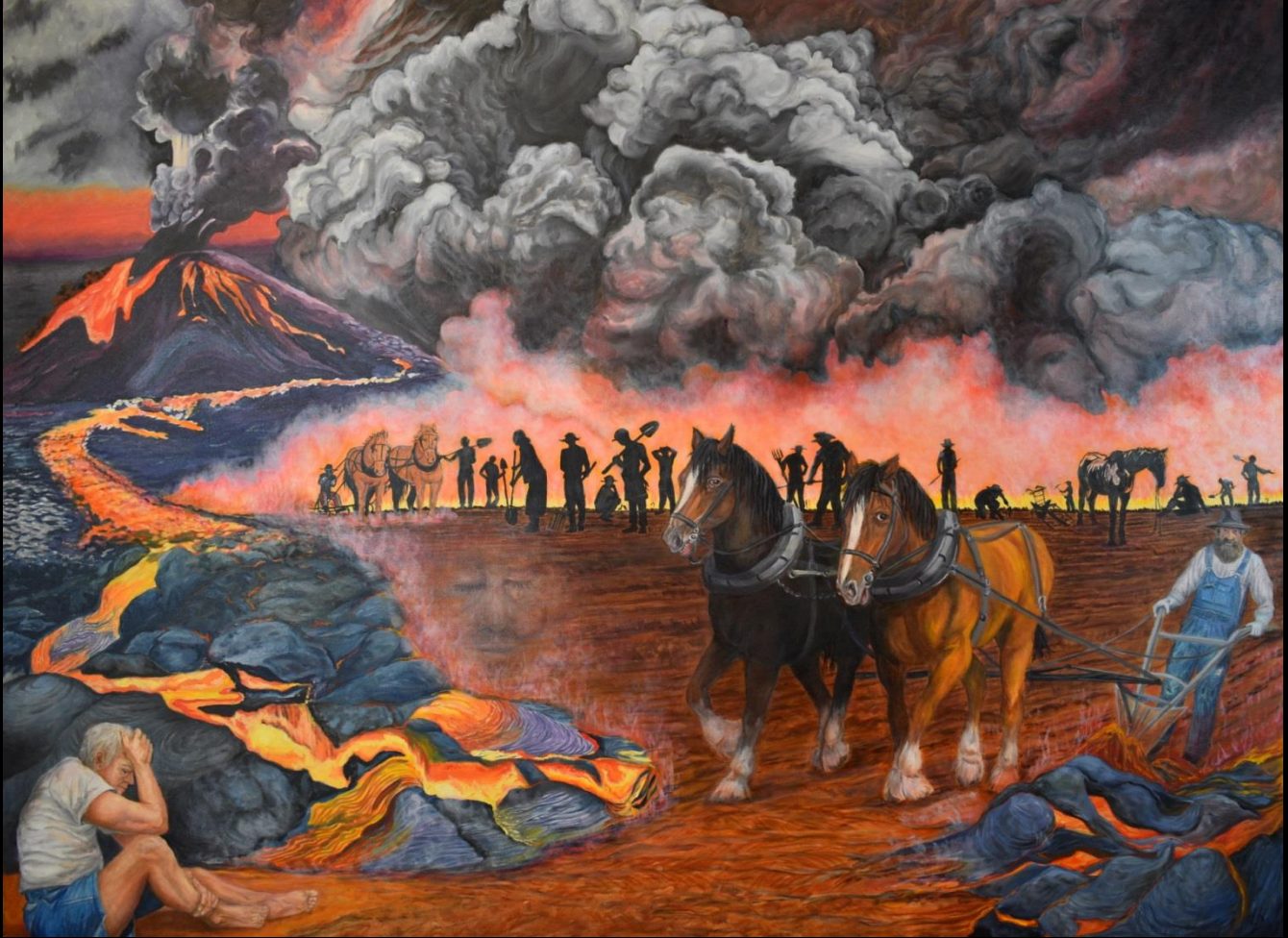
"Plowing Hell - COVID" by Dale Bishop